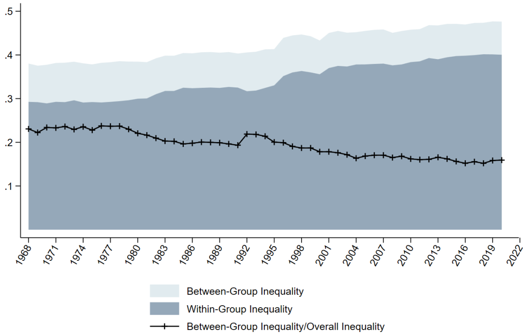
Figure 2: Household-level income inequality within and between demographic subgroups. Households are grouped by the age ( \leq 35 , 36–45, 46–55, 56–65, > 65 ), education (no college, some college, Bachelor’s degree, more than Bachelor’s degree), sex (male, female), and race (Black, White, other) of the household head.

of the aggregate inequality can be accounted for by demographic characteristics and whether that has changed over time. The results from section V allow us to study this question using the Gini coefficient as our measure of inequality. 16